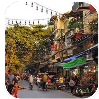
Hanoi Old Quarter