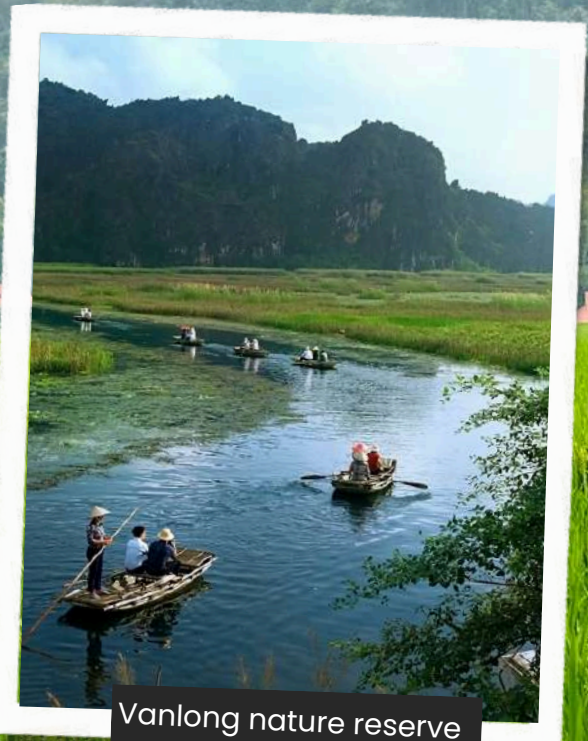
Vanlong nature reserve