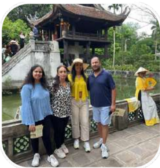
One Pillar Pagoda